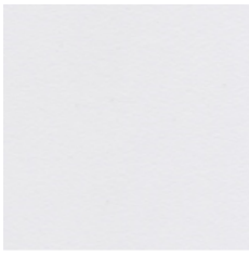
Ice White 012